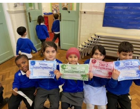
Good Work Winners